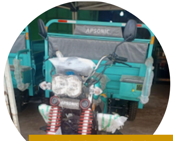
MOTORCYCLE RICKSHAW COST: $2500

This year, we are launching a pilot program to promote income generation to a limited number of select zakat recipients, inshaAllah. We hope to allow these individuals to begin earning for themselves and outgrow dependency on zakat.