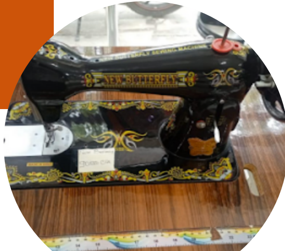
SEWING MACHINE COST: $400