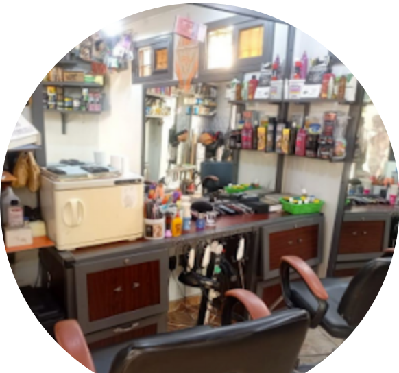
BARBER SHOP COST: $1500