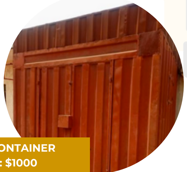
SALES CONTAINER COST: $1000